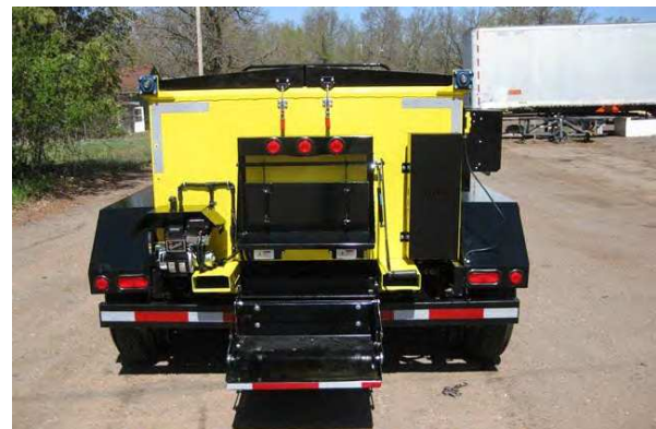
Discharge Doors shall also include gas assist opening system for easy open/close and provide infinite positioning. Shall not require latches or hooks to hold open. Design shall have sloped inner walls to move mix forward to allow easy shoveling. Two discharge ports open to shovel platform constructed of 1/4" 304 stainless steel. Dual Doors with gas assist opening for infinite positions. Door size to be 13" high by 18" wide each, for a total 13" high by 36" wide.