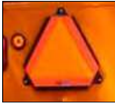
SMV-Sign DOT Approved Slow Moving Vehicle Sign.