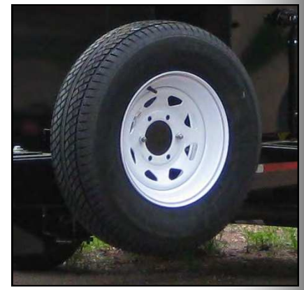
Spare Tire Spare tire with holder mounted onto frame of unit.