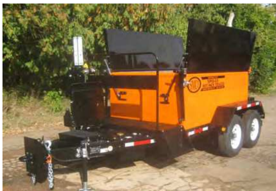
Top Loading Doors shall be covered with a minimum of 16 gauge steel. Shall utilize gas assist shocks with lock downs. Loading doors shall be insulated with 3" closed cell polyurethane foam. Doors in the open position shall form a funnel into heating hopper. Shall be of tapered design with water lip to allow water shedding. Shall have minimal clearance between top doors and hopper to decrease heat loss. Each door shall be of a tapered design, 5 5/16" down to 2 3/16".