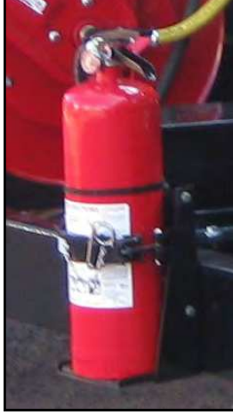
Fire Extinguisher 10 LB. ABC dry chemical fire extinguisher