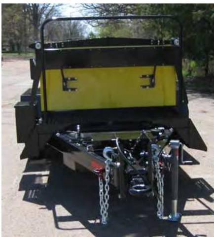
Front Platform With Railing and Steps Shall add easy hopper access. To be constructed of grip strut grating. Shall be bolted to frame.