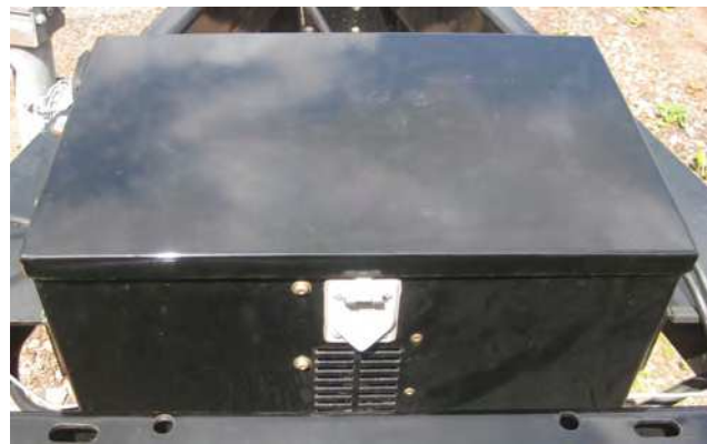
Battery Charger Marine grade charger to maintain battery.