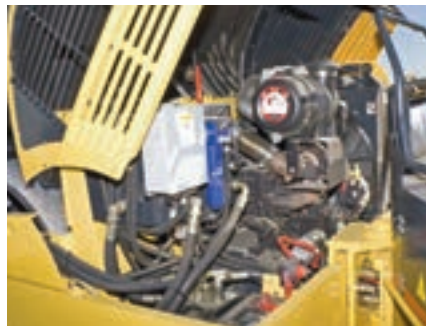
The engine is placed low in the frame for ease of service and operator visibility