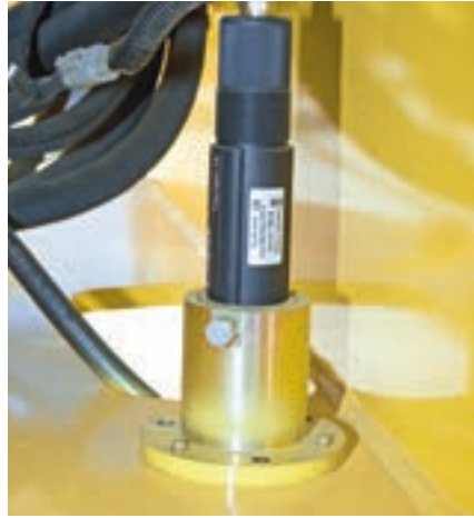
The optional Asphalt Mat Temperature Sensing System measures the material temperature which is critical for asphalt mix projects.