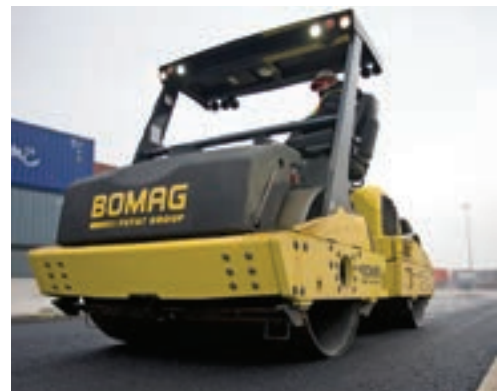
BW278AD-4 in action on asphalt