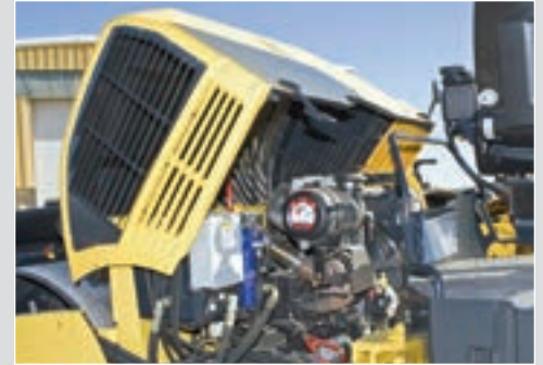
Easy opening, single hood, allows service with your feet on the ground.