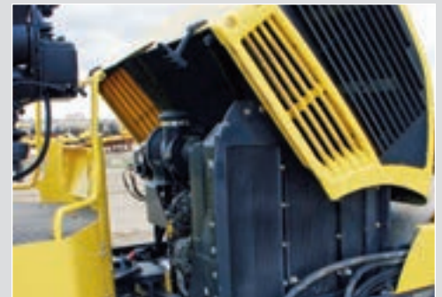
Vertical side by side coolers allow easy access for quick cleaning.