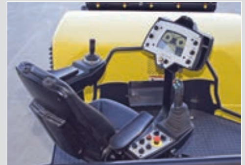
Joystick control travel direction, speed, steering, manual vibration on/off and control actuation from either seating position.